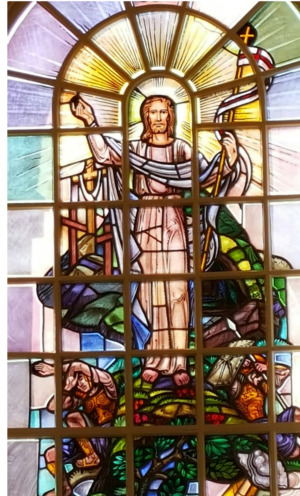
EASTER DAY, APRIL 5, 2026